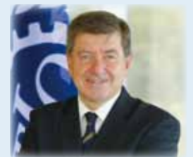
Guy Ryder ILO Director-General 2 February 2015

Once again, I would like to congratulate RENGO for its achievement and wish the Institute for Solidarity-based Society every success.